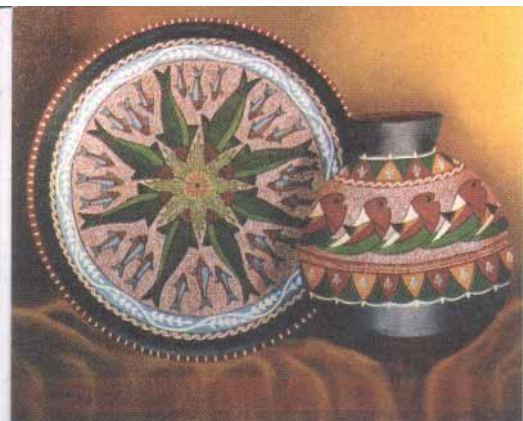
Roots, Arts & Crafts